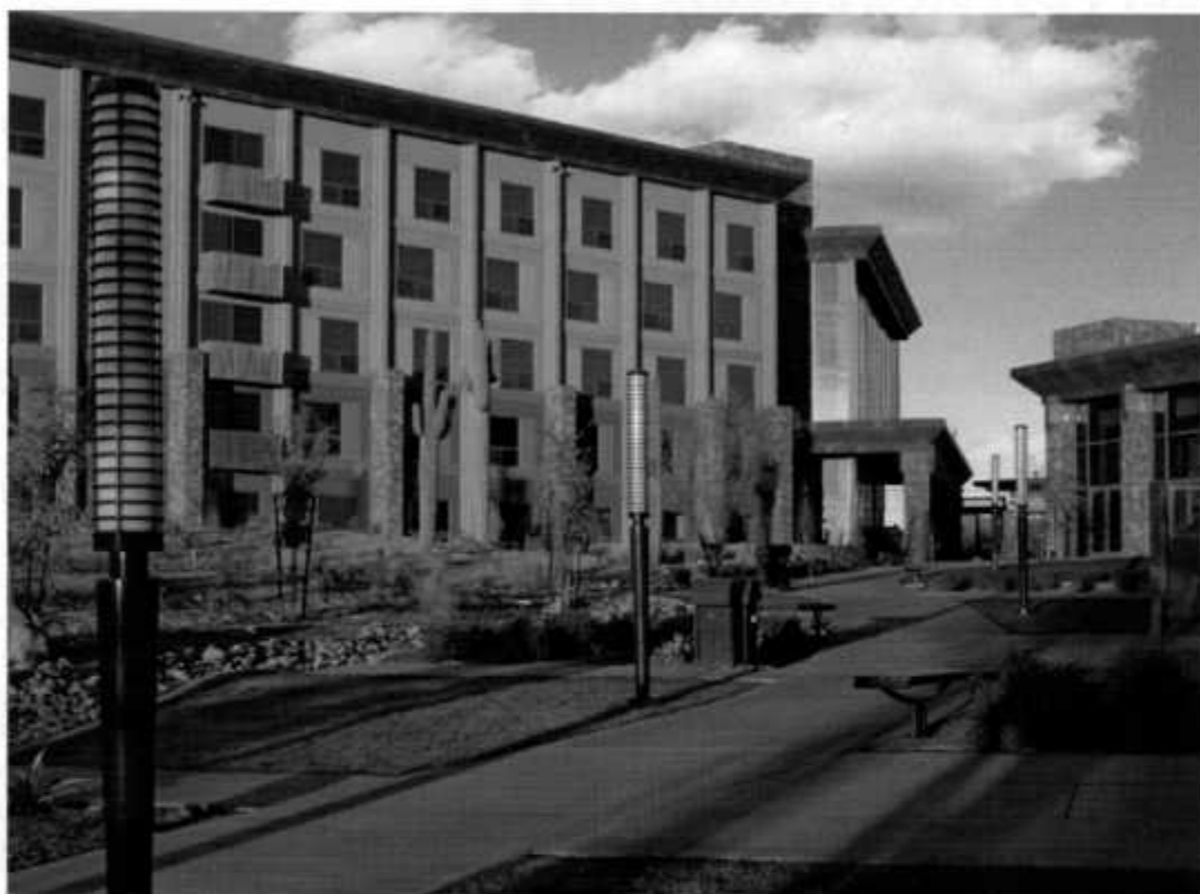
The Radisson Fort McDowell Resort, owned and operated by the Fort McDowell Yavapai Tribe.